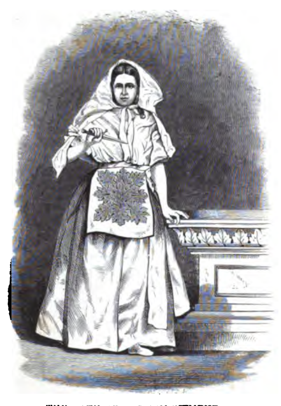
THE OATH OF THE ENDOWMENT